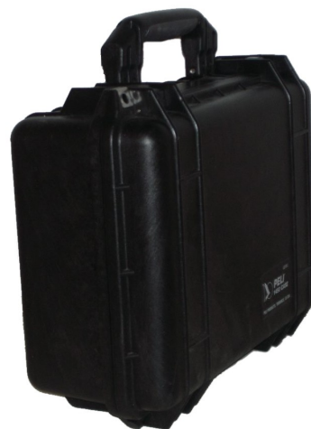
RUBEN 005 P&J transport case.

The RUBEN 005 P&J plastometer has many self diagnostics features to ensure the right measuring result. The user can zero-calibrate it in a simple and fast way.